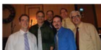
Polka Country Musicians