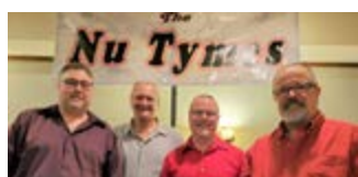
The Nu Tymes