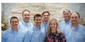
The New Generation