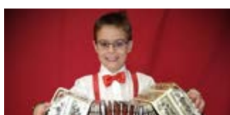
Zander's Music Raymakers