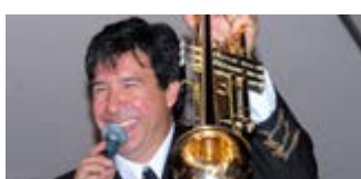
The Polka Family Band