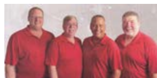
Music Connection Polka Band