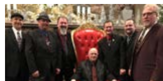
The New Brass Express