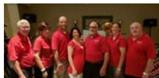
The Goodtime Dutchmen